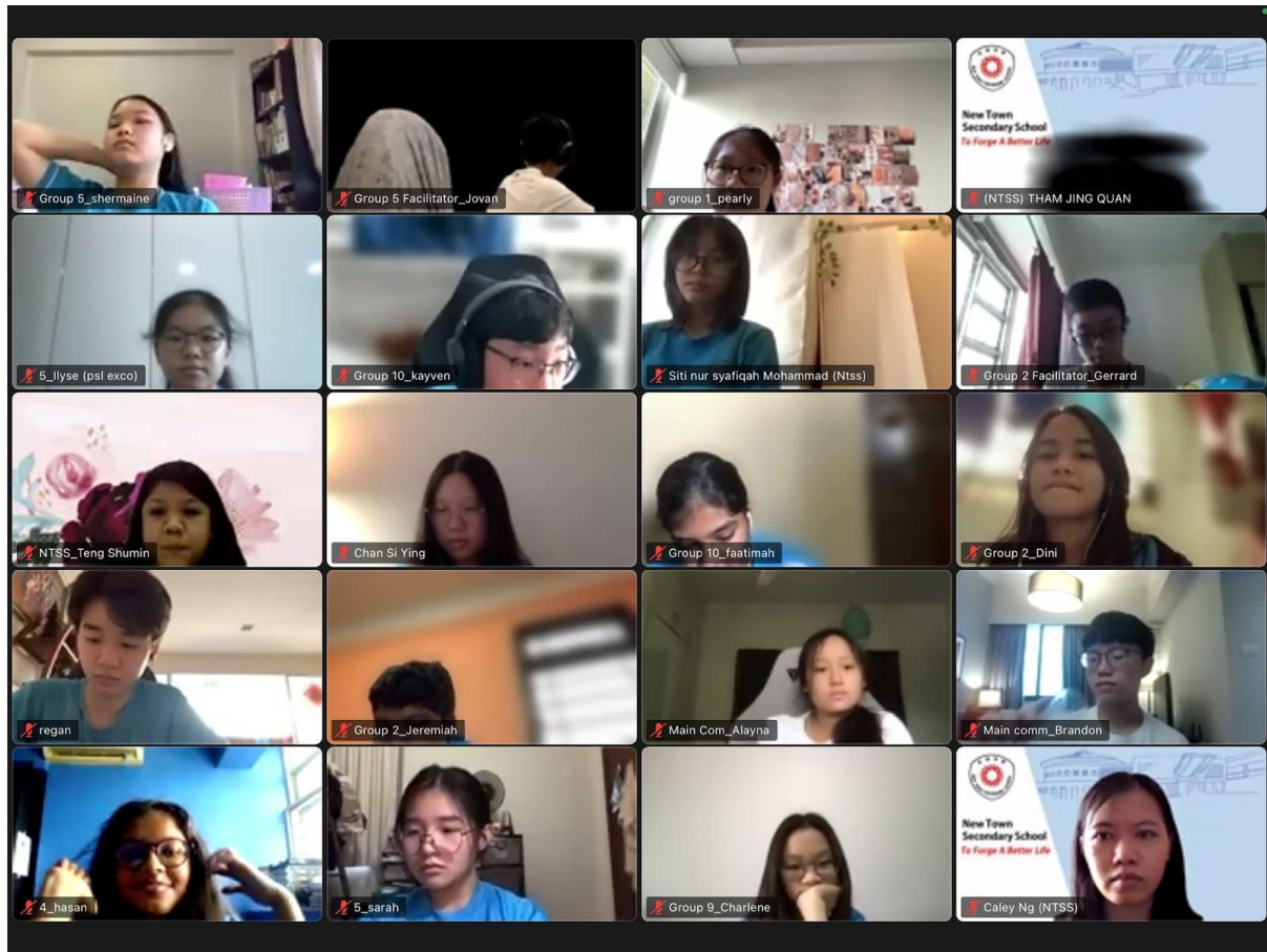
Group 2 Facilitators and their participants in the SL Challenge