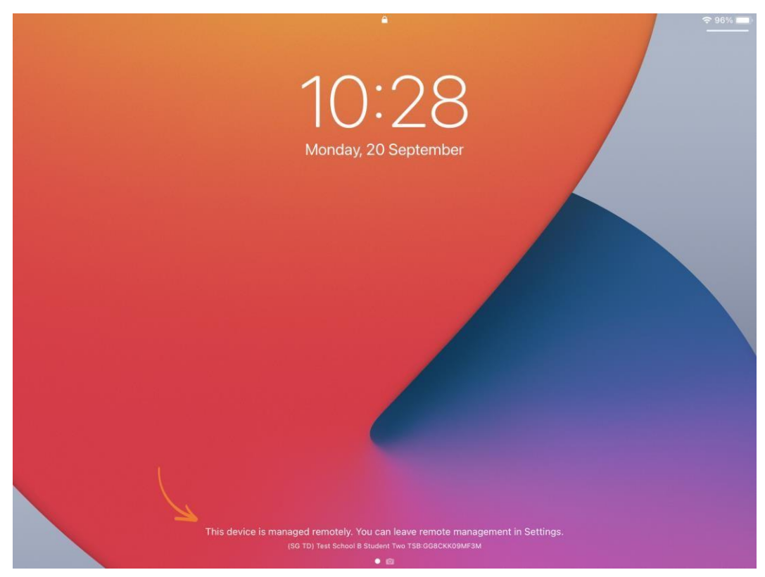
Figure 3: View of the locked screen for an iPad managed by the DMA

Check #1: Switch off your iPad, then switch it on again. Upon 1<sup>st</sup> power-on of your iPad after the DMA has been uninstalled, you should no longer see the text "This device is managed remotely. You can leave remote management in Settings." near the bottom of the locked screen (shown in Figure 3).