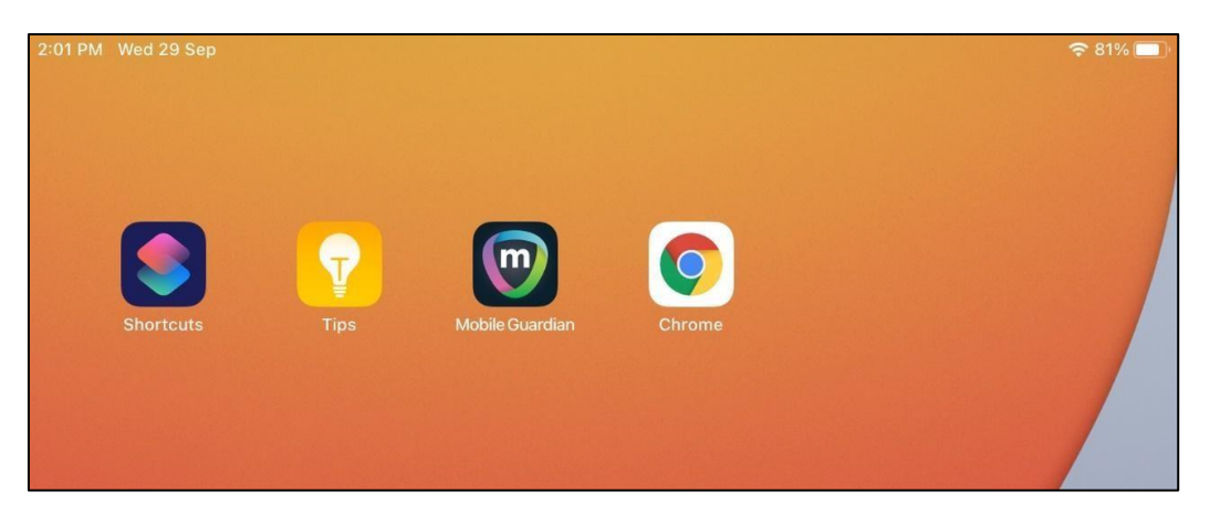
Figure 5: Partial view of the home screen for an iPad managed by the DMA

Check #3: You should no longer see the Mobile Guardian application in the PLD (Figure 5)